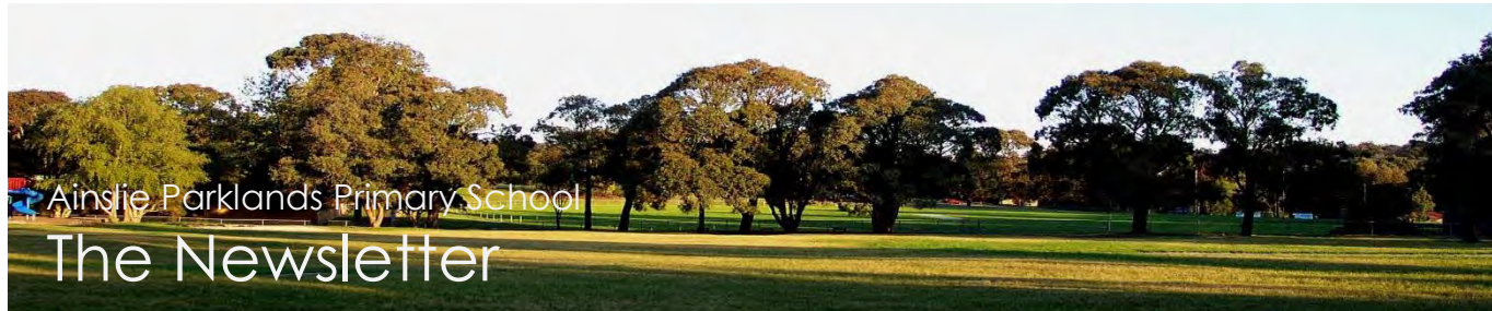
Views over Ainslie Park