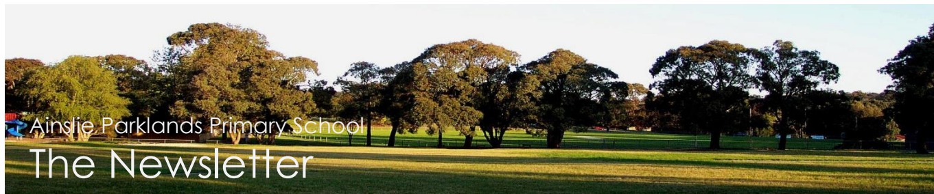
Views over Ainslie Park