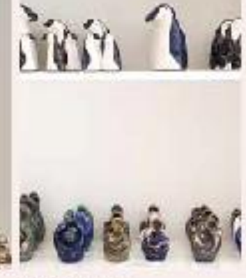
ManArt Ceramics Sculptural ceramics www.manmauer.com

Clay Sisters Functional and decorative ceramics