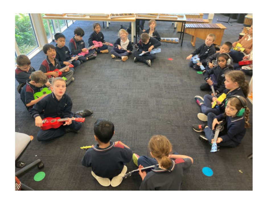
Grade 3 & 4 students doing a great job learning "Click Sticks" which has three different parts on tuned percussion.

Grade 1 & 2 Students doing a brilliant job learning the C Chord on ukulele to accompany themselves on our class song "Eucalyptus"